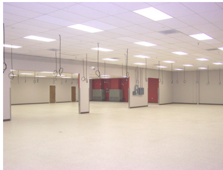
Net Repair work area