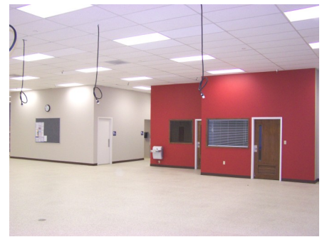
Offices and rest room area